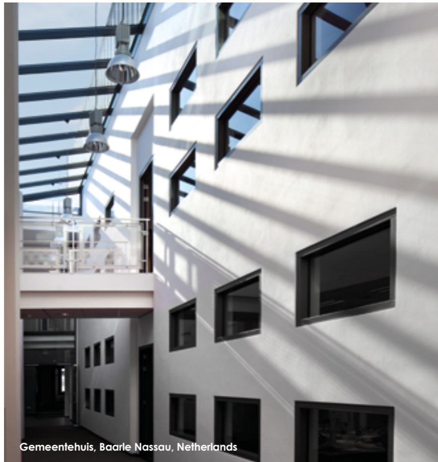
Gemeentehuis, Baarle Nassau, Netherlands