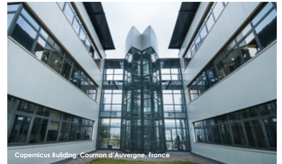
Copernicus Building, Cournon d'Auvergne, France