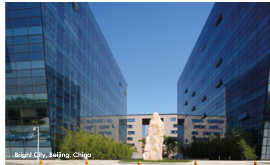
Bright City, Beijing, China

Through a wide range of standard and optional features, our sliding door systems can achieve the right look and performance for any project.